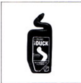
Free after shave with any two pairs of socks