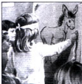
Pin the tail on the honkey