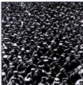
Staff night out stroke in stroke out stroke in stroke out